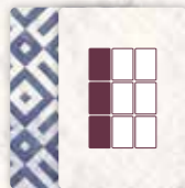
9 solo cards