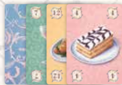
72 food cards

Welcome to Louis XIV's royal dinner! Play as waiters serving rich and picky nobles at this extravagant party. At night you can immerse yourself in the thrill of the masquerade but do not get too distracted. Nobody likes to wait on their food!