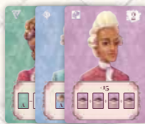
24 noble cards